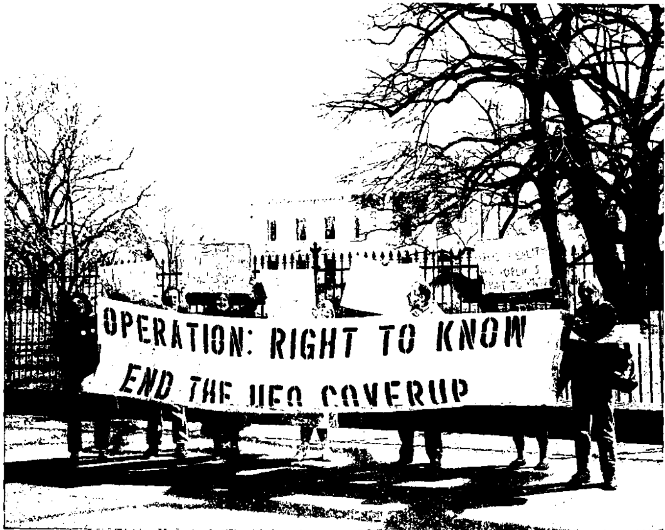
WASHINGTON UFO DEMONSTRATION